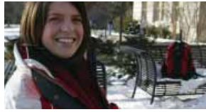
Full-tuition Scholarships Established