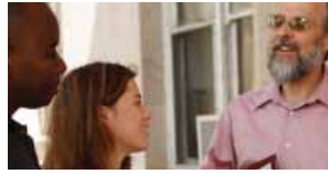
ISU Faculty and Staff Surpass $21 Million